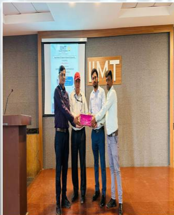
The Guest Speaker Being Felicitated by The Department