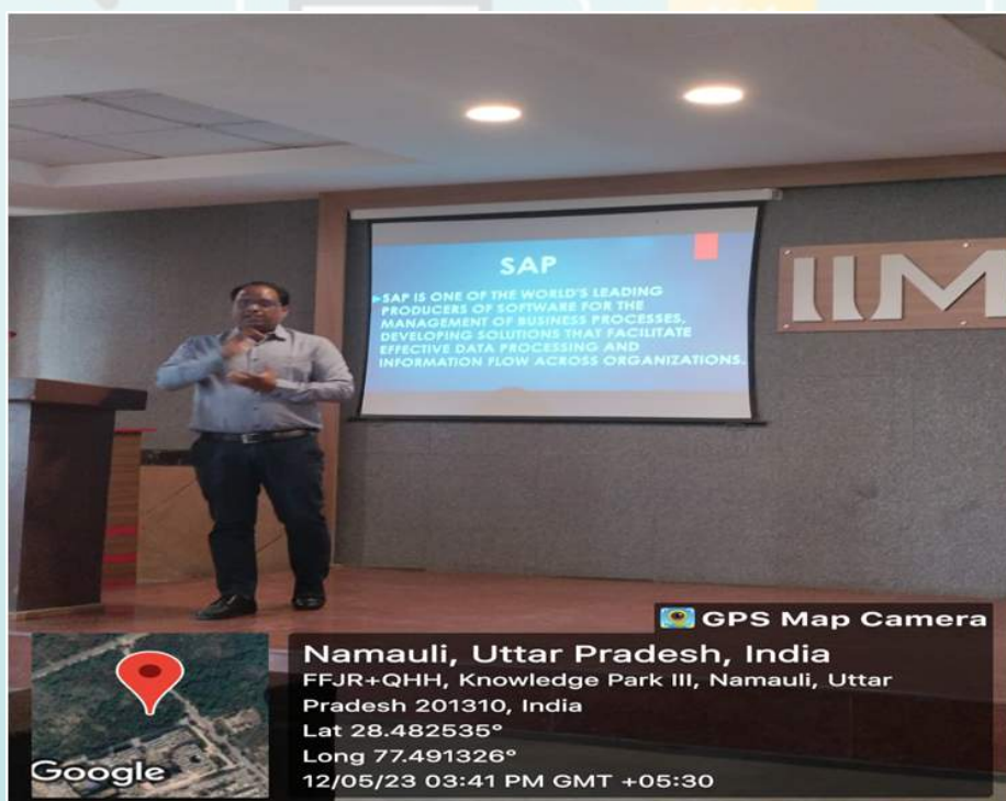
The speaker delivering a talk on SAP